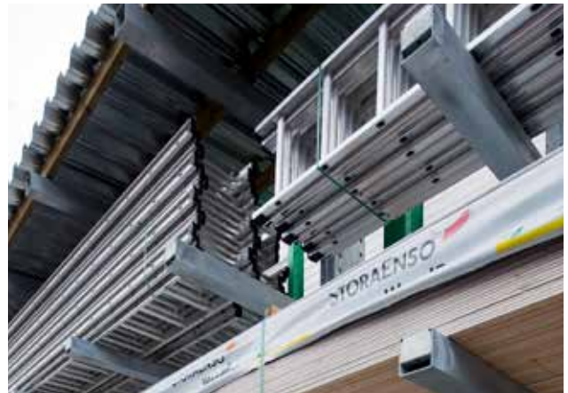
Heavy duty cantilever - Cantilever roof, side and back cladding

Cantilever racking can be mounted on mobile bases saving space while still allowing access to individual items.