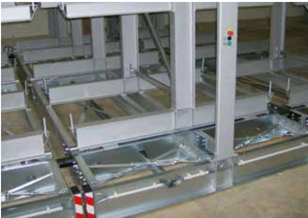
Heavy duty cantilever - Cantilever mobile bases

Preventing items from rolling off the end of the arm and can be removed for improved access to goods.