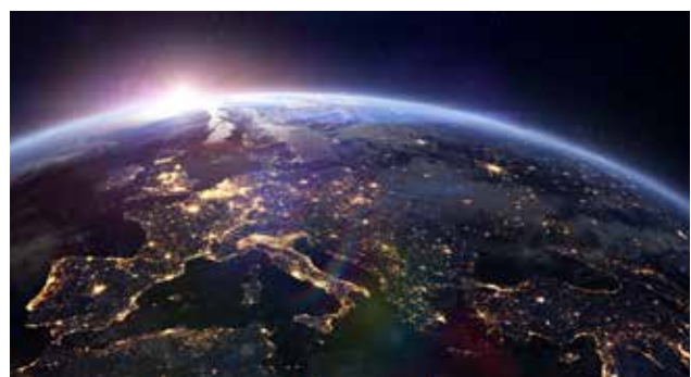
400 customer facing staff