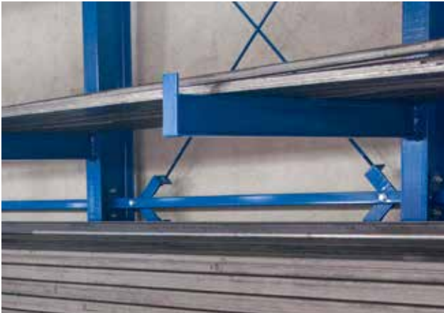
Heavy duty cantilever - Fixed end stopper

Welded end plates are used as a heavy duty solution for stopping the stored items from rolling off the rack.