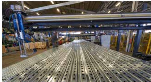
6 manufacturing facilities