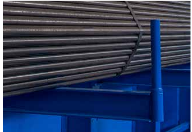
Heavy duty cantilever - Removable round stoppers

Welded end plates are used as a heavy duty solution for stopping the stored items from rolling off the rack.